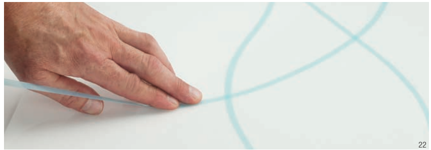
With blue vinyl backing and rubber adhesive, Scotch® Fine Line Masking Tape 4737T offers best-in-class conformability and line sharpness for curves in high value processes.