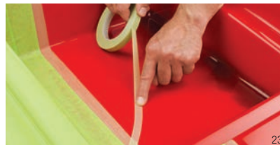
A combination of Scotch® Fine Line Masking Tape and 3M™ Crepe Masking Tape helps to create sharp, high-impact paint lines on an in-mold application in the marine industry.