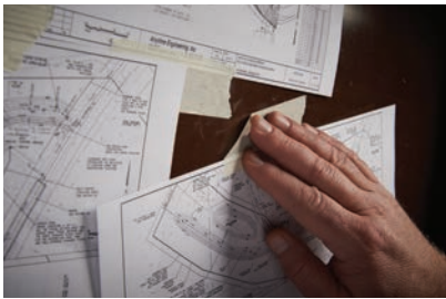
Use 3M™ Value Masking Tape 101+ for light-duty attaching.