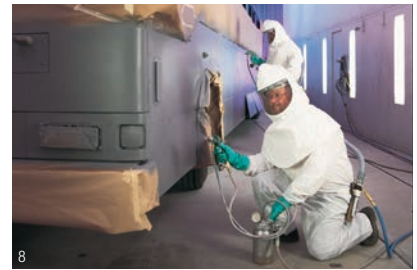
Consider 501+ for bake temperatures up to 300°F (149°C) or for multiple bake cycles.