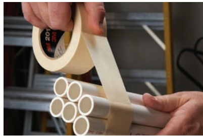
Use 3M™ General Masking Tape 201+ to quickly bundle parts.