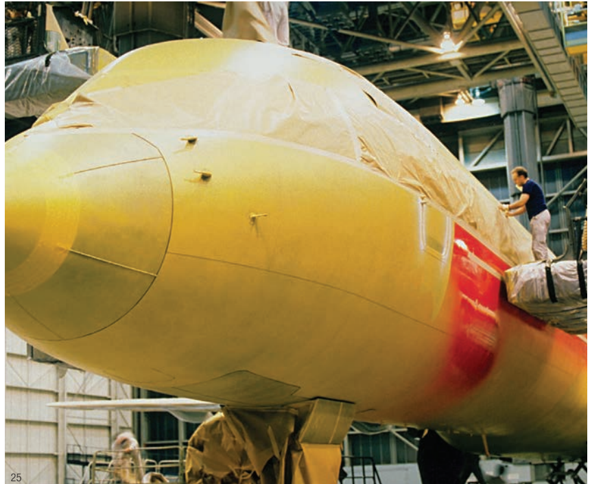
25 With the wide variety of 3M™ Masking Tapes, you can select from a variety of backings, adhesion strengths, clean removal properties, and temperature range performance.