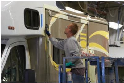
Consider 301+ for general purpose, low to medium temperature applications up to 225°F (107°C).