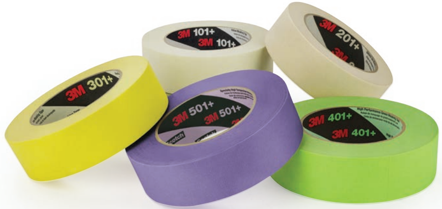
3M™ Masking Tapes 101+, 201+, 301+, 401+ and 501+.