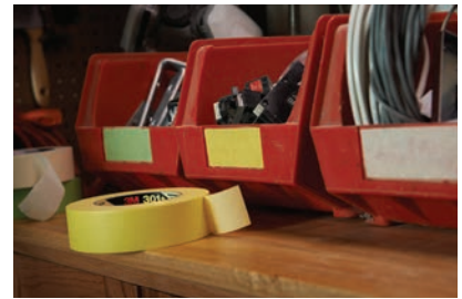
3M™ Performance Yellow Masking Tape 301+ is ideal for labeling and identifying applications.