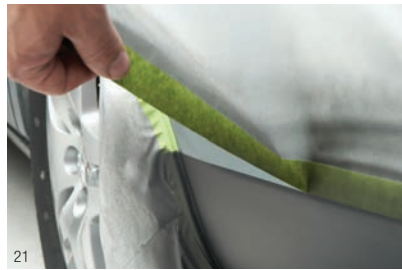
Consider 401+ for critical masking applications with temperatures up to 250°F (121°C).